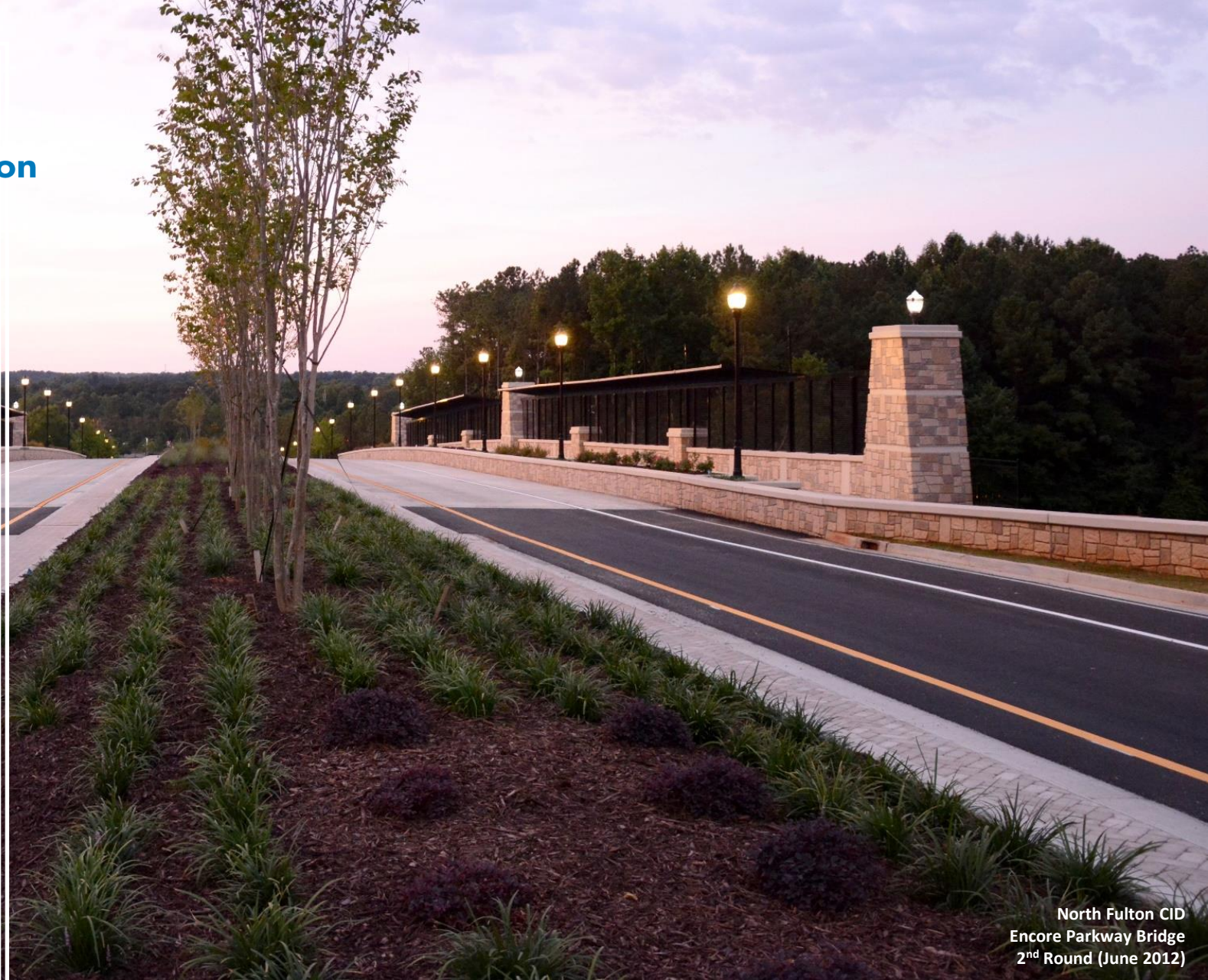
North Fulton CID Encore Parkway Bridge 2 nd Round (June 2012)