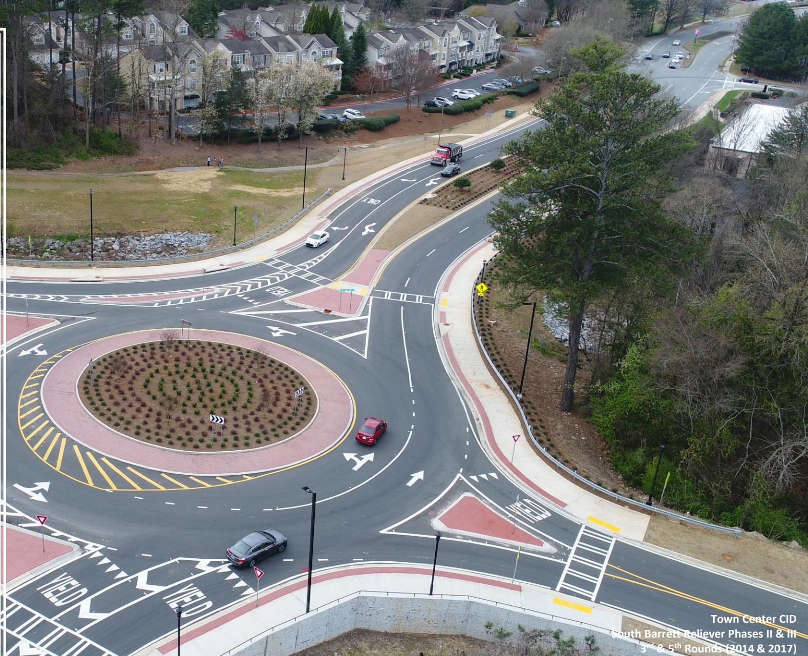
Town Center CID South Barrett Reliever Phases II & III 3 rd & 5 th Rounds (2014 & 2017)