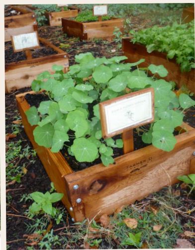
Urban Planter Box