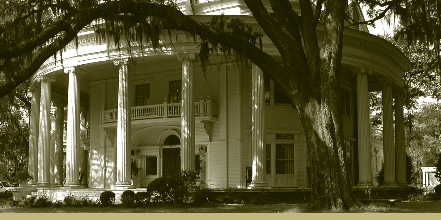
GEORGIA PLANNER – August 2010 Newsletter of the Georgia Chapter of the American Planning Association