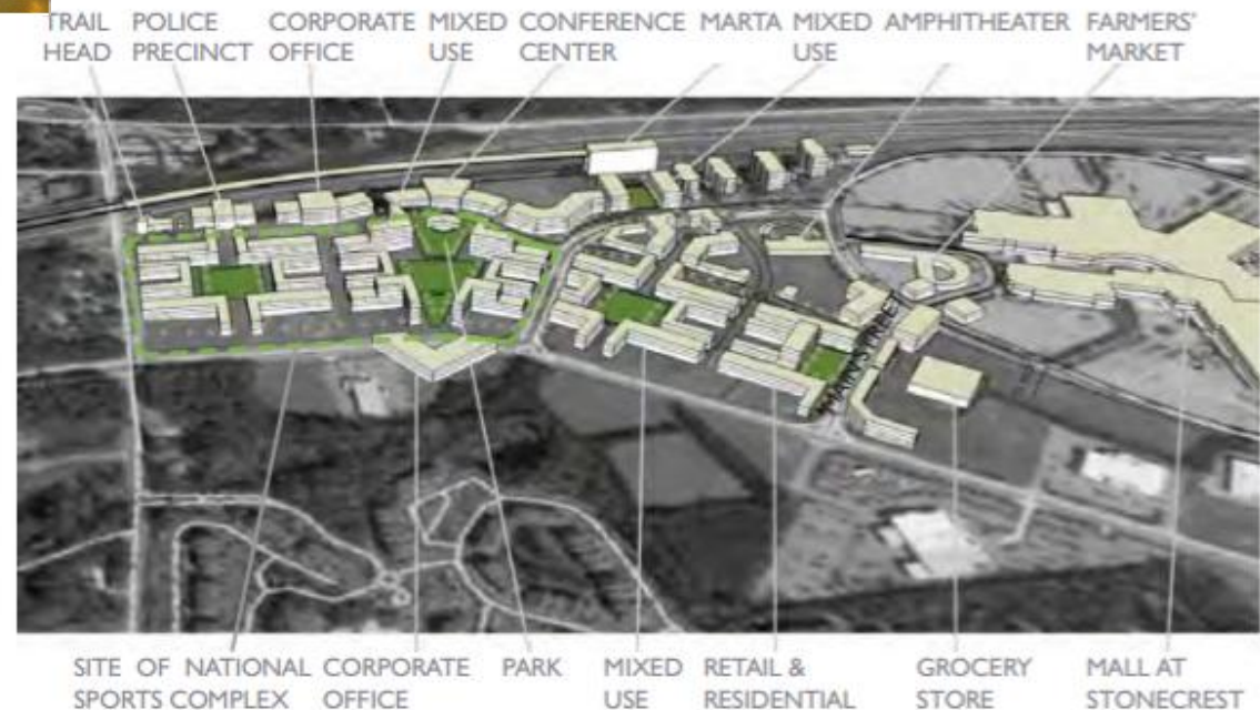
FIGURE 4c: Lifestyle CENTER ENTERTAINMENT NODE